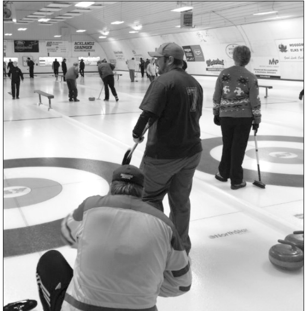
Teams participating in a bonspiel at the Moosomin curling rink.