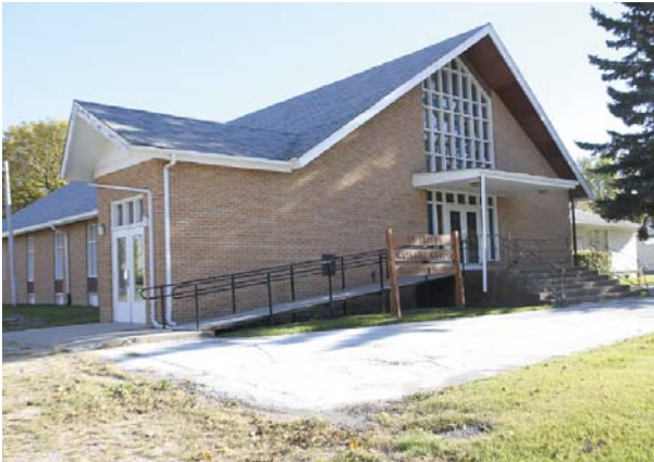
Clockwise from the top: St. Mary's Church in Moosomin, St. Andrew's Church south of Wapella and St. Alphonsus Church in Rocanville.