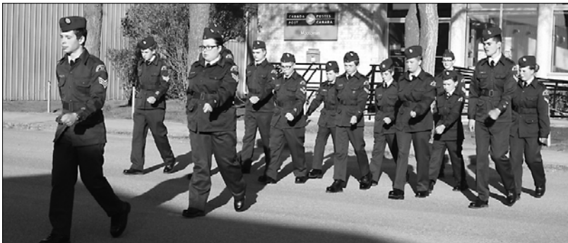
The Air Cadets annual parade held each spring.

If you would like to learn more about the MFRC and our programs, stop by any weekday morning for coffee, email mfrc@sasktel.net , check us out on Facebook or watch for weekly updates in The World-Spectator.