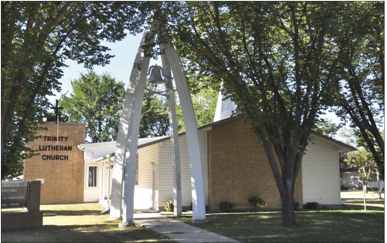
Trinity Lutheran Church in Moosomin.