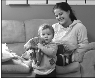
A mom and her son share some time together at the MFRC.

morning from 9 a.m. to 11:30 a.m. A huge variety of toys are available daily for children to play with, many of which don’t fit in your own home such