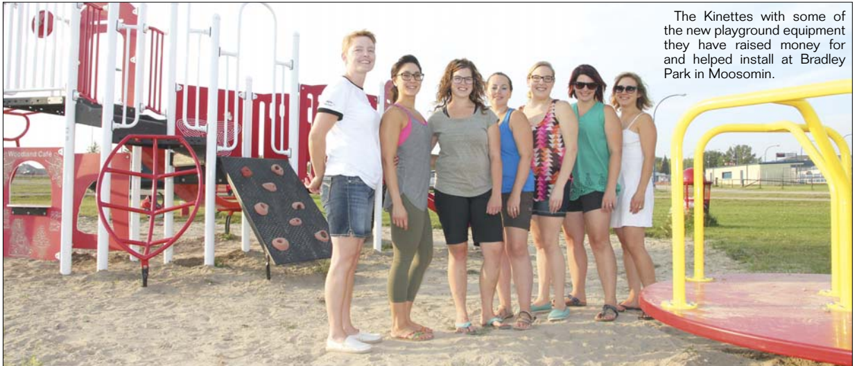
The Kinettes with some of the new playground equipment they have raised money for and helped install at Bradley Park in Moosomin.