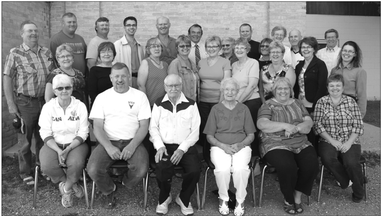
Members of the Society for the Preservation of the Moosomin Armoury pose for a photo outside of the Armoury hall.