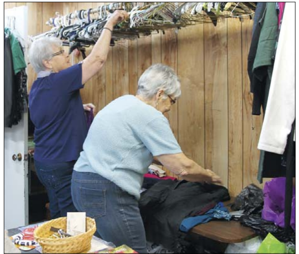
Volunteers sorting clothing at the thrift store.