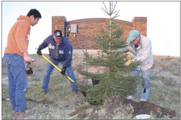
Moosomin Shrine Club members planting trees around the town of Moosomin sign this past summer.