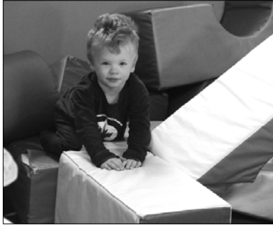
A child plays on the giant foam blocks at the MFRC.

The MFRC strives to meet the needs of all fami-