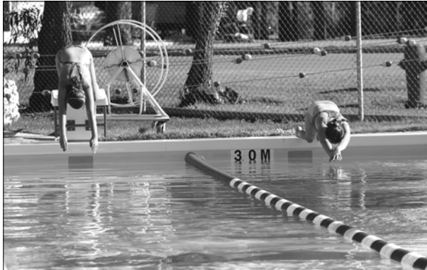
Above and below: Some of the Gators competing at swim meets during the 2015 summer swim season.