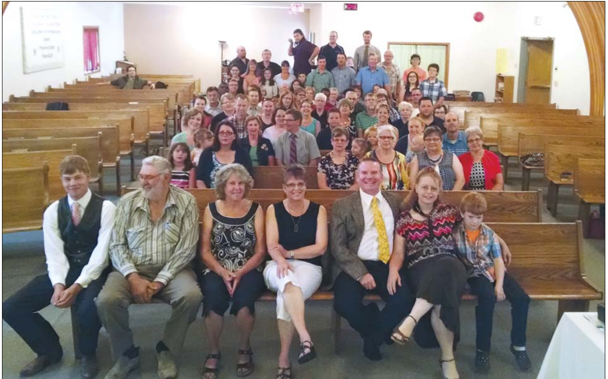
Members of the Moosomin Baptist Church family