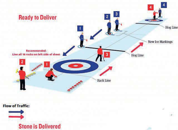
This illustration shows how to social distance on the curling ice.