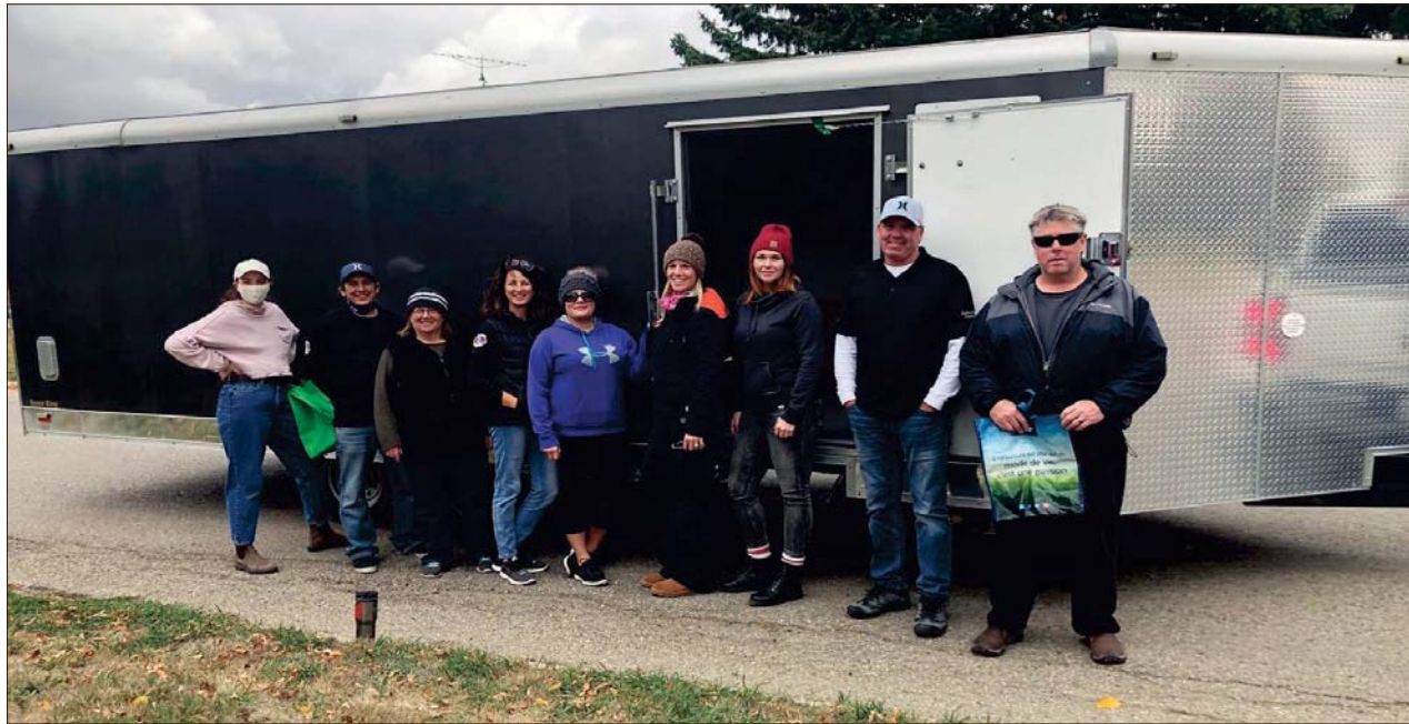
Several Lions members and volunteers canvassed the town of Redvers on September 27, collecting non-perishable items and winter clothing for the Carlyle Food Bank which provides a vital service to individuals in need in our area.