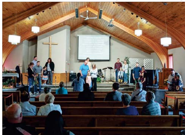
A recent Kindergarten Bible presentation at the Moosomin Baptist Church.

"We really view this as a new era within the church. When the previous pastor left, the interim time before I came, the church spent a lot of time trying to figure out who we are as a church and where we want to go, spending some time figuring out their