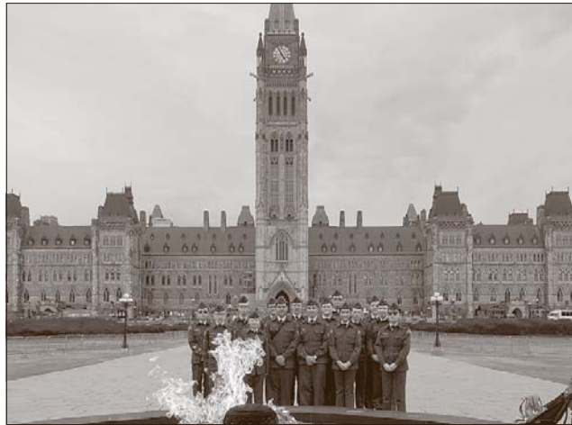
The squadron standing outside the eternal flame and Centre Block of the Parliament Buildings in Ottawa 2019