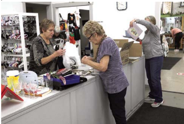
Volunteers sorting and pricing items at the thrift store.

We would love to have you, and any help is very much appreciated!