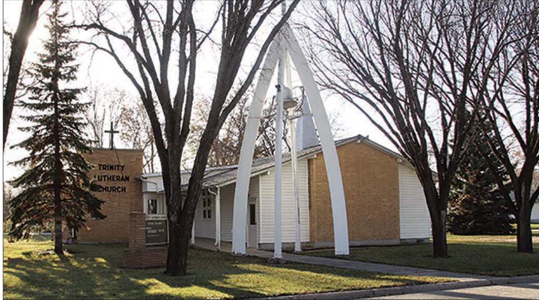
Trinity Lutheran Church in Moosomin.