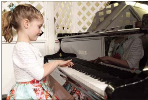
Left: A young musician performing a piano piece at the adjudicator's showcase at the Moosomin & District Music Festival.