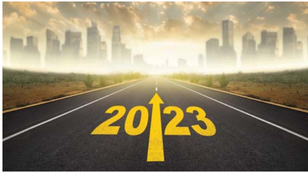
Thanks to the local students for sharing what they think is ahead in 2023!