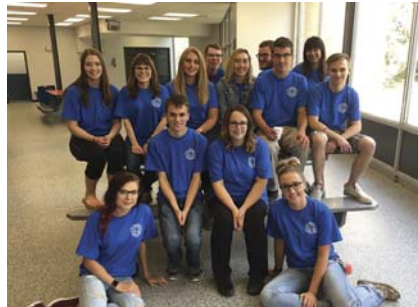
Students of St. Peter's College