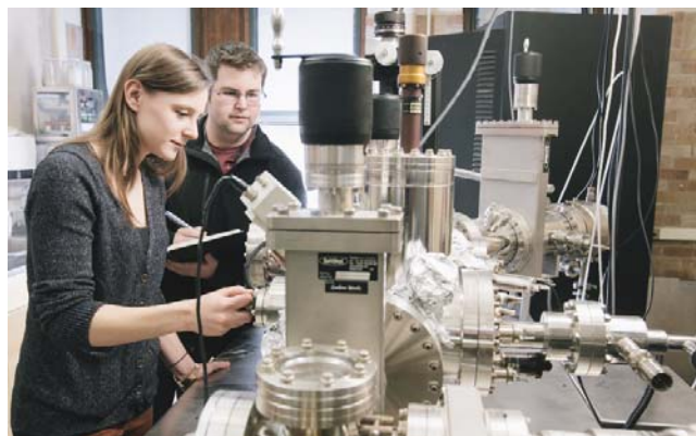
Engineering physics students study in the scanning tunneling microscope lab at the University of Saskatchewan.

The deadline to apply to the College of Engineering to start classes in fall 2018 is February 15. To learn more about the admission process and the programs the U of S offers, visit admissions.usask.ca .