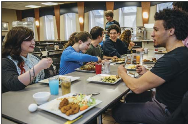
Students having lunch at the Luther College Cafeteria.