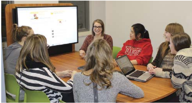
Students in a small class setting.