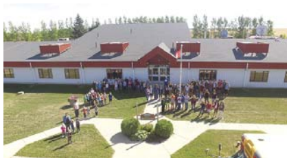
École de Bellegarde.

École de Bellegarde is a small and remarkable school in the southeast corner of the province. We offer a complete education from preschool three years old to grade 12. French is the language of instruction, except for English classes which start in grade 4, and which also follow the same curriculum taught in anglophone schools throughout the province. This makes us the only school in our region where students will graduate genuinely bilingual and evenly competent in both languages. Our classrooms are smaller. Students receive plenty of attention in a safe and friendly environment - it is almost an extension of your child's home!