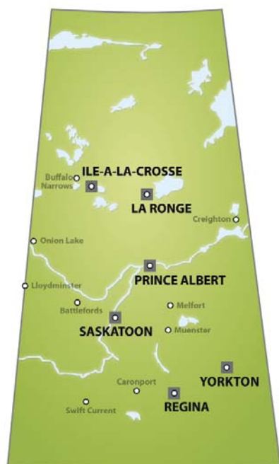
○ Pre-professional Year (Yr 1) ■ BSN Years 2 – 4