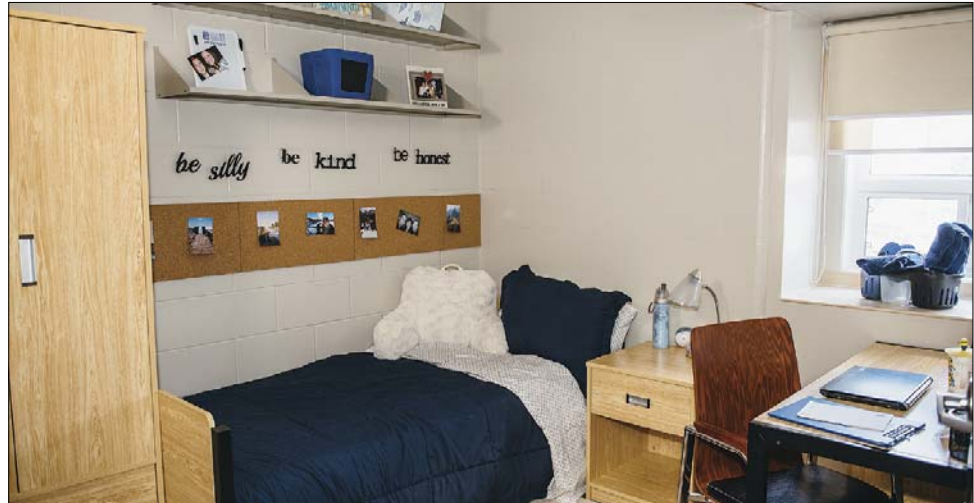
A private dorm room at the Luther Residence.

Students living in the Luther Residence can choose from one of three meal plan options, with current plans ranging per se-