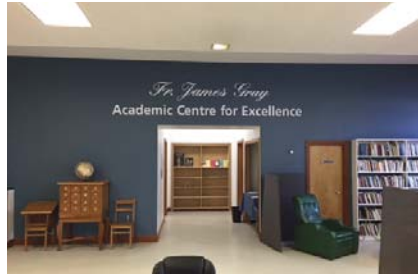
St. Peter's Renovated Academic Centre of Excellence.