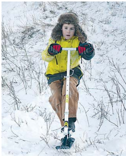
Above and left: Here is a "farm" kid at our tobogganing hill. Can you tell by the Carharts and the calf sleigh toboggan?