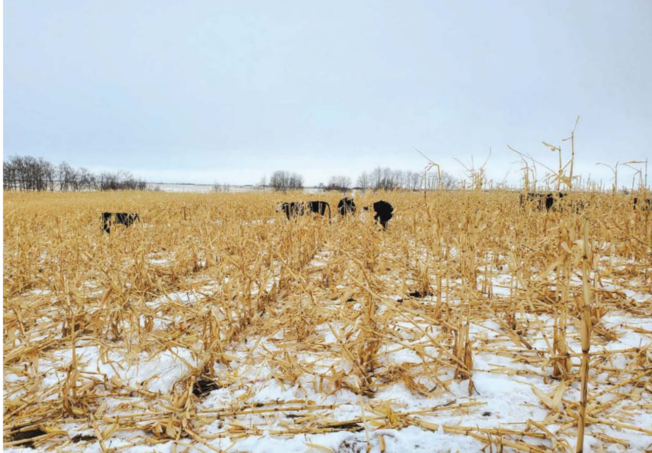
Moosomin area farmer Trevor Green has been corn grazing his cattle this winter as an alternative option that helps save money on fuel.