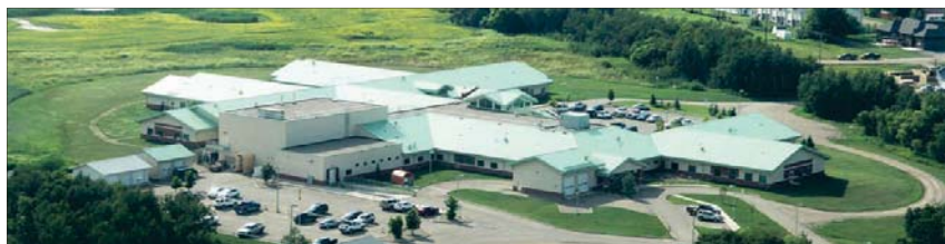
A wide range of medical services are available at the Southeast Integrated Care Centre in Moosomin, provided by a number of health care professionals.

There are four full-time permanent physicians, three part-time permanent physicians, two locums, one nurse practitioner and one resident who are part of the Family Practice Centre.