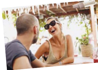
With a bar area in your yard, you'll have everything you need to whip up fun evenings in good company.

both for the area itself and the path leading up to it. For the rest, it's all a matter of taste: exotic or modern; chic or rustic; what does your dream