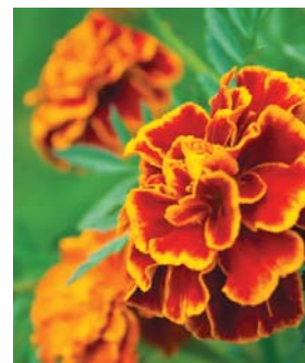
In addition to being easy to grow, marigolds act as a repellent against certain insects like aphids.

Ready to get your hands dirty? For sure-fire success in the garden, ask the experts at your local plant nursery or garden centre for advice.