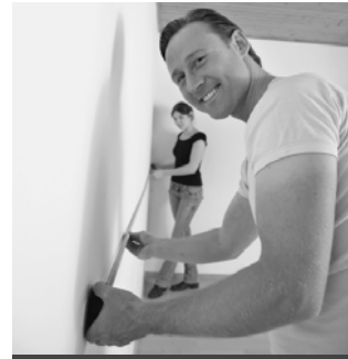
Have your room measurements on hand when shopping for furniture.

It's easy to feel claustrophobic in a cluttered room. Instead of packing too many pieces of furniture into one space, choose items with multiple uses such as futons or tables that double as storage.