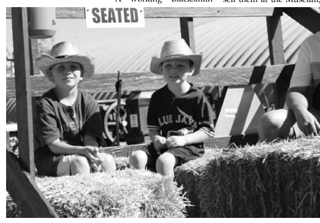
Enjoying the hay ride at threshing day 2016.