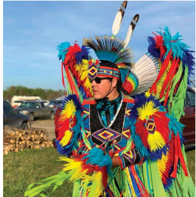
Kahkewistahaw's Powwow is coming up June 21-23 at Kahkewistahaw. Leading up to it is Chief Kahkewistahaw Days through the week.