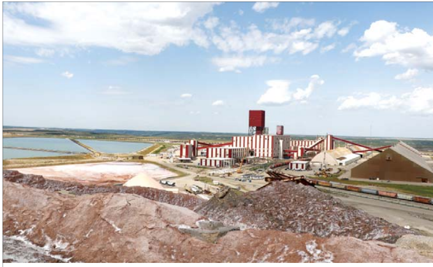
The Nutrien Rocanville mine site.

Before joining the Potash procurement team, I was in Transportation, Distribution