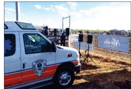
Hutch Ambulance in the Moosomin parade, above, and at the Moosomin Rodeo, right.